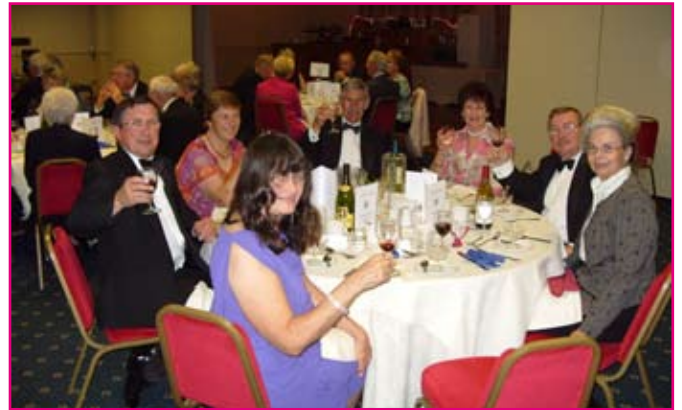
A Toast to another 150 years!

To those fortunate to be there, a very happy occasion, to those unable to, a missed pleasure, perhaps we can all meet at the 200 th Celebrations! ... Copy/pictures,Ed.